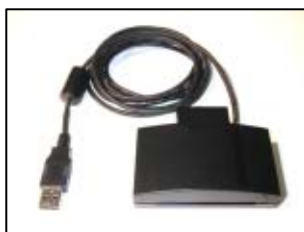
Service Card Reader